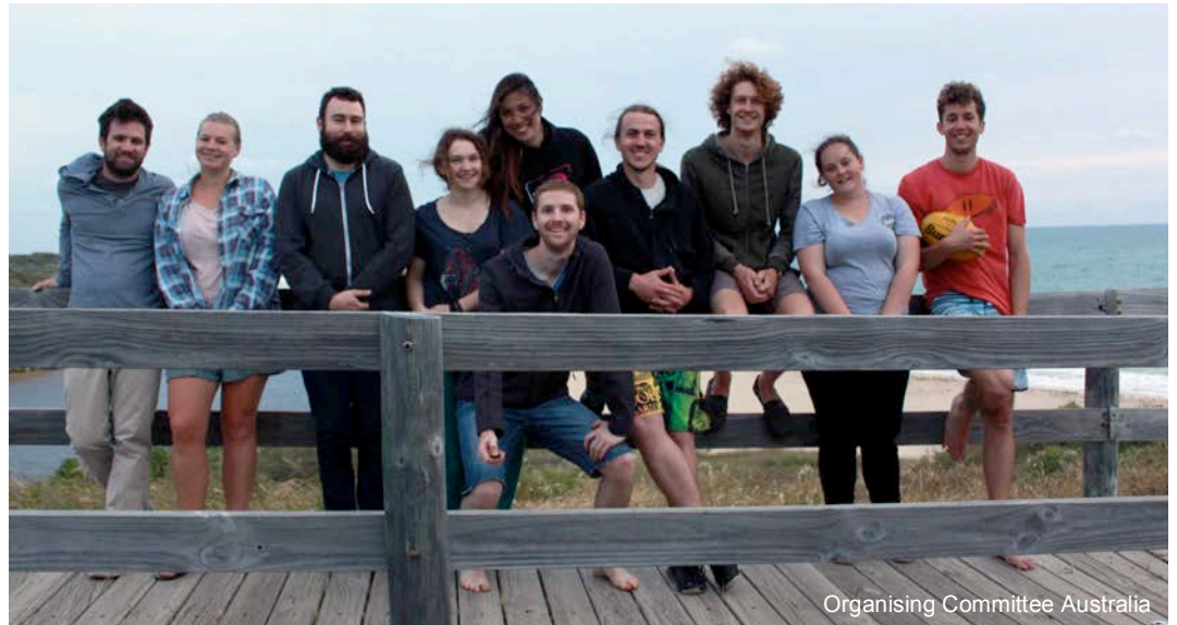
Organising Committee Australia

We are now in the process of outlining the logistical arrangements for the event, and getting our team of volunteers together to help make this event a success. Our community event the Forgotten Earth: Reconnecting with Nature Fair is also shaping up to be a really integral component of the Summit and we are looking forward to opening the ideas of WSEN to the wider community. If you are interested in finding out more about this event, please check out this link: https://www.facebook.com/events/978485972185569/